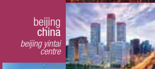
beijing china beijing vintal centre