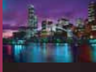
melbourne australia 365 little collins