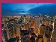
manila philippines fort legend tower