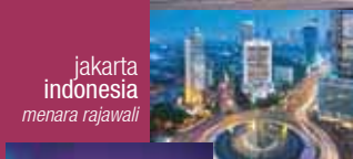
jakarta indonesia menara rajawali